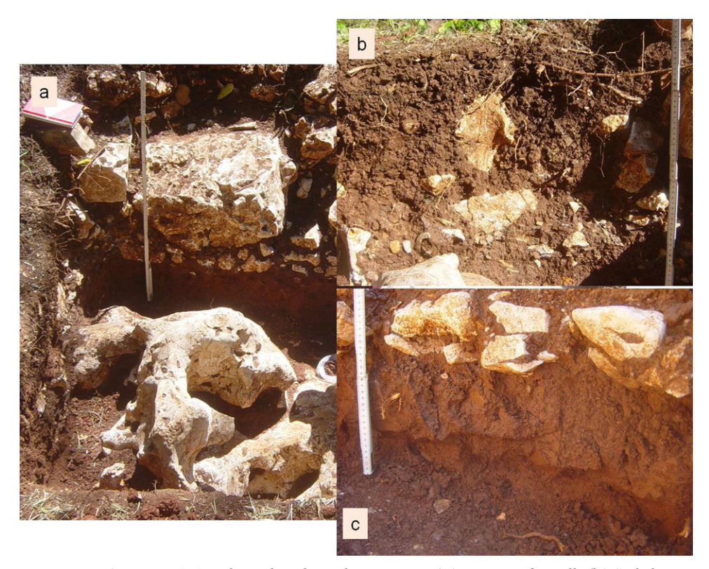
Figure 7.4. Operation 140 at the archaeological excavation: (a.) remains of a wall; (b.) Soil close to excavation surface; (c.) Buried soil showing similar characteristics of the Luvisol in Figure 7.2.

paleosol units and contains archaeological materials. Vertic features predominate in paleosols 3 in TBI, 5 in TBII, and in 8Ass and 7Ass of El Pochote. Humus accumulation is the main pedogenetic process in the younger paleosols found in the alluvial terrace.