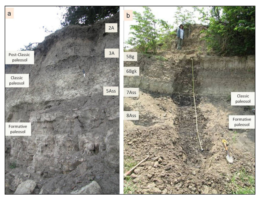
Figure 7.3. Pedological sections, showing the paleosols' stratigraphic location: (a.) Tierra Blanca II; (b.) El Pochote.

(see Figure 7.2d); and the last, inside the archaeological excavation (Operation 114), associated with an interesting midden located behind the Palace at the site of Chinikiha. It is highly plausible that the Chinikihá palace functioned as the residence for the ruling family.