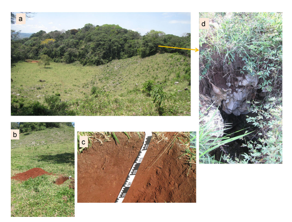
Figure 7.2. Chiniquihá soils: (a.) Landscape view, showing the differences in altitude; (b.) Rendzinas in the slope of the Sierra; (c.) and (d.) Luvisols at the valley bottom.

2A. Abundant artifacts have been found: Postclassic in 2A and 2C, and Classic in 3A, 3C. Modern soil signature of the carbon stable isotope composition is -21.9‰. 2A and 3A have a little bit higher values, -20.2% and -19.4‰, respectively.